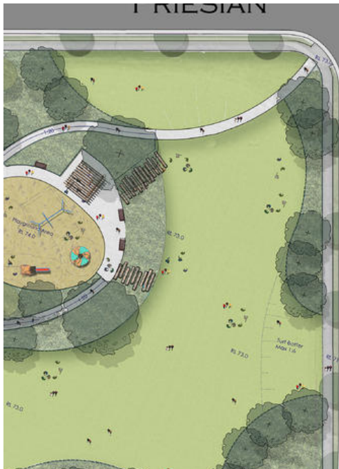
20 Half Penny Ave, Kellyville