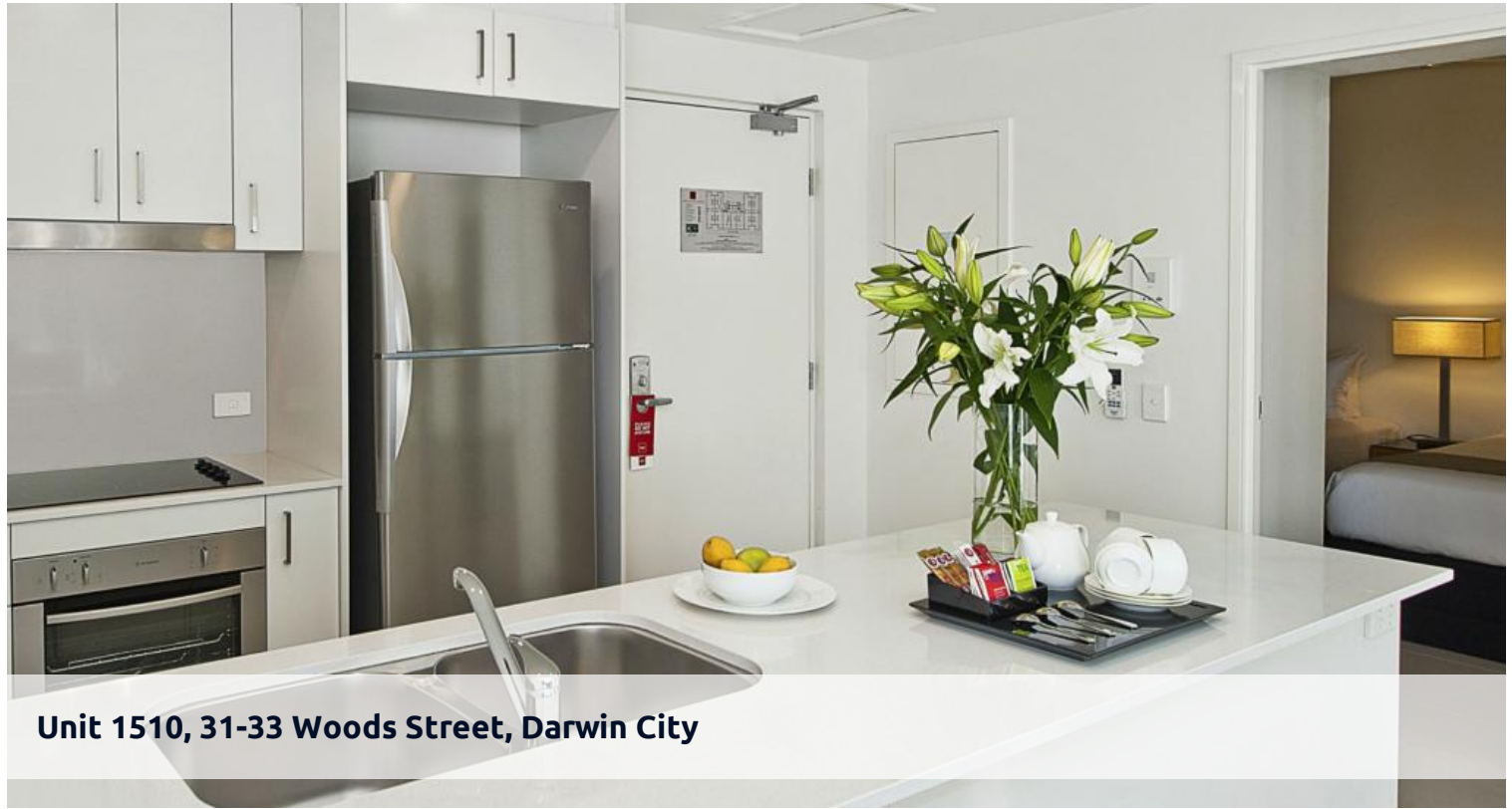
Unit 1510, 31-33 Woods Street, Darwin City